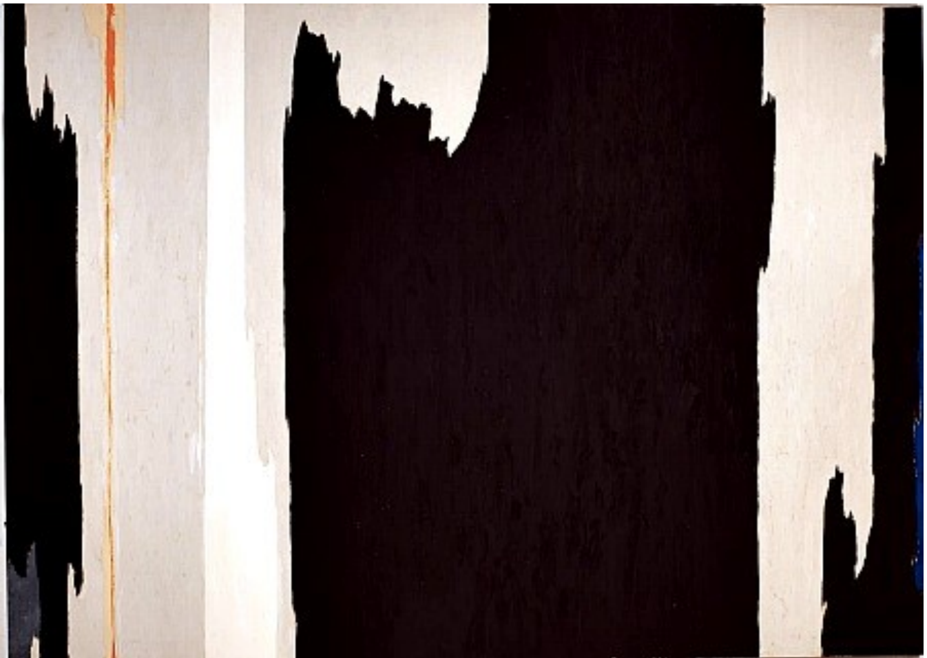
Painting - Clifford Still

St. Thomas Episcopal Church 231 Sunset Ave. Sunnyvale, CA 94086 408-736-4155 www.stthomas-svale.org