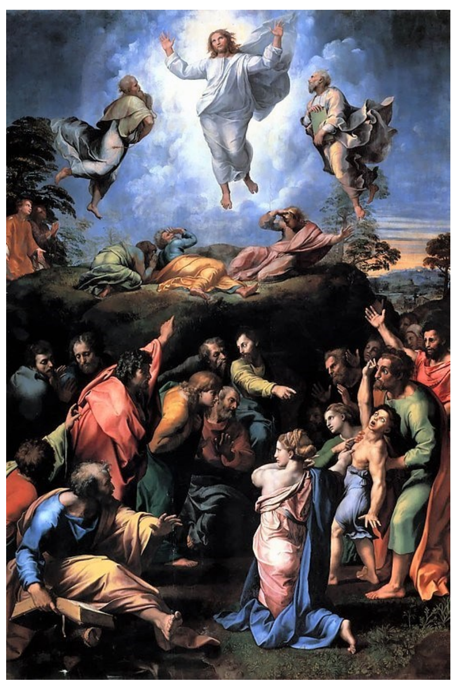
The Transfiguratioon - Raphael

St. Thomas Episcopal Church 231 Sunset Ave. Sunnyvale, CA 94086 408-736-4155 www.stthomas-svale.org